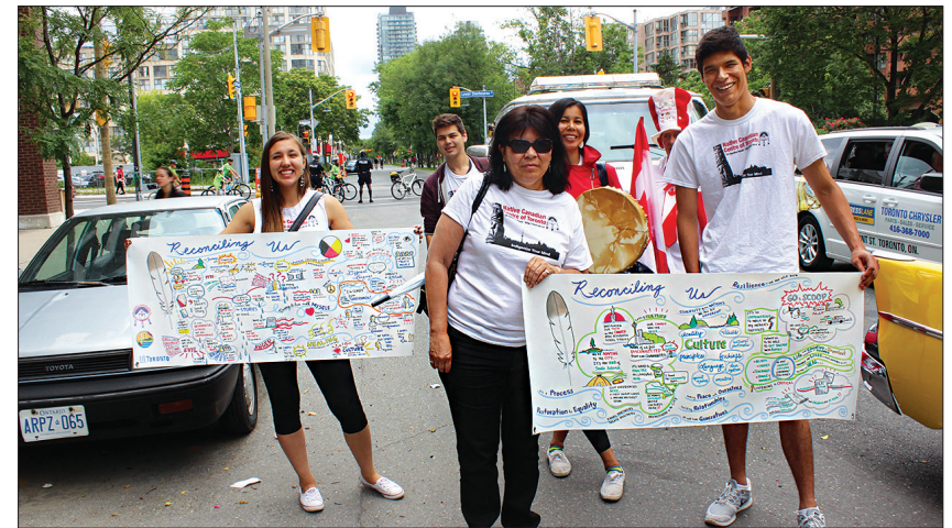
Participant from the Native Canadian Centre proudly carried the workshop banners during the July 1st Canada Day Parade

The drawings were displayed at Dundas Square during Aboriginal Day celebrations on June 24, 2015 and at the St Lawrence Market July 1, 2015 Canada Day parade.